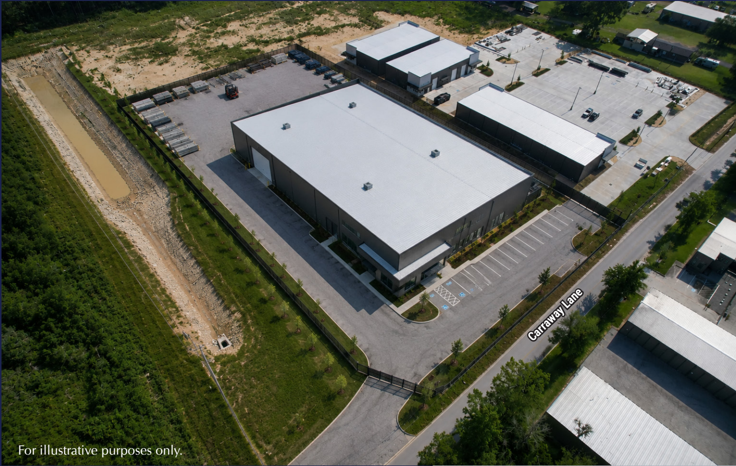
For illustrative purposes only.